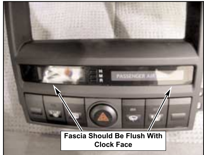
Fascia Should Be Flush With Clock Face